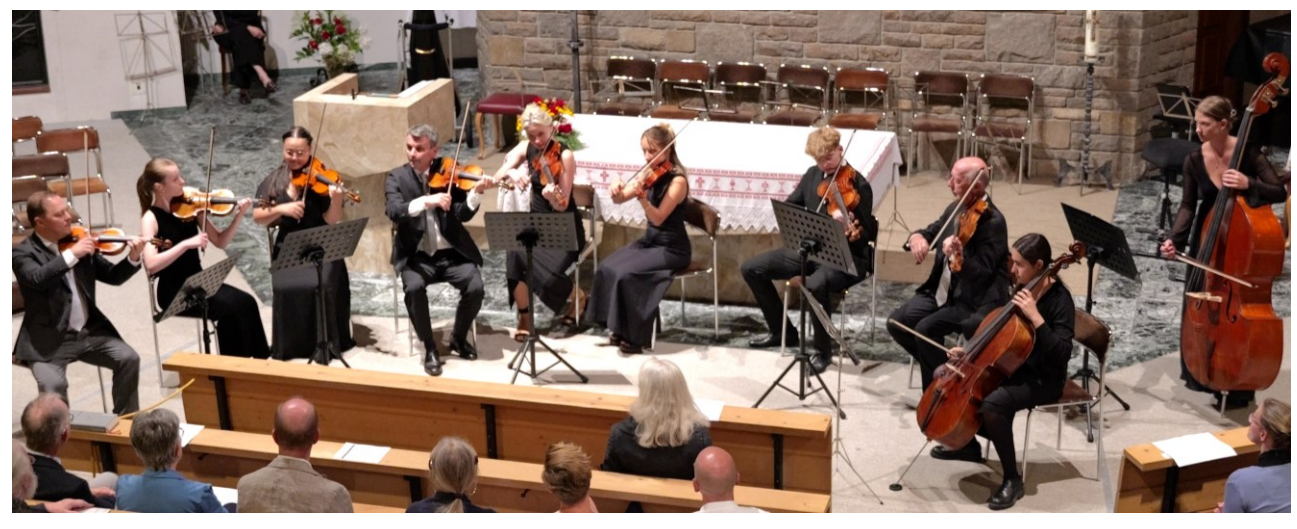
The string ensemble of Camerata Prima Wien at the chamber music concert in the Christ the King Church Mallnitz (22. 8.