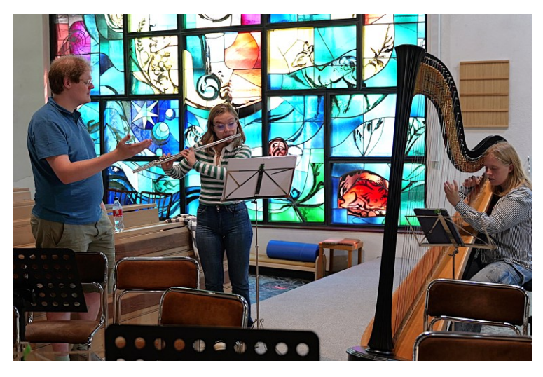
In addition to their work in the chamber orchestra, engaging with chamber music holds an important place in the development of the young masters. Therefore, the members of the Camerata also perform in various chamber music ensembles, all of which are led by members of the Vienna Philharmonic.